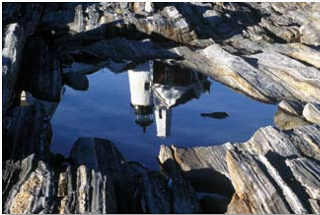
Tidal Pool at Pemaquid,, Pemaquid, Maine

Duncan Whitaker 202-362-4726 duncan@whitakerphotography.com www.whitakerphotography.com