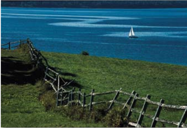
Sailing, East Blue Hill, Maine