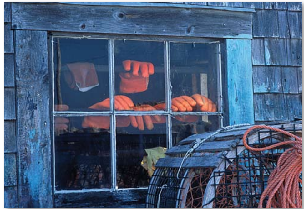
Orange Gloves, Nova Scotia

To view additional images of his work and for information on sizes and prices, visit his website at www.whitakerphotography.com .