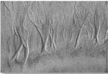
Sand Forest, Pemaquid, Maine

The images in this brochure are a sample of a substantial portfolio of works entitled DOWN EAST. These images capture the essence of Maine and Nova Scotia with simplicity and clarity, be it the coastal waters, harbors, working boats or fishing gear. They offer the viewer a fresh and different way of seeing the familiar.