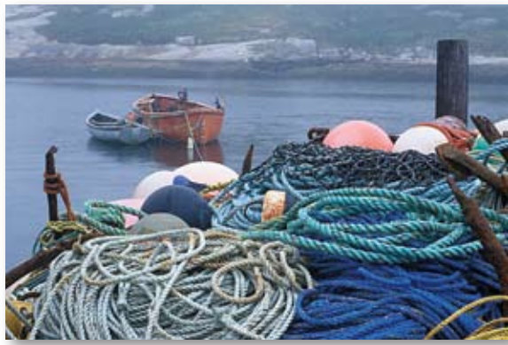
Harbor at Peggy's Cove, Nova Scotia